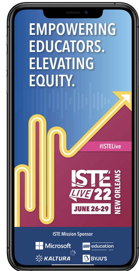
ISTELive 22 mobile app

All payments due no later than May 31, 2022. Ads cannot be canceled. No refunds will be issued.